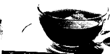
Tea & Hot Drinks